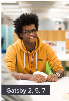
Gatsby 2, 5, 7