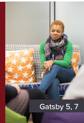
Gatsby 5, 7

In addition to mock interviews, we also offer a general presentation on preparing for university interviews which aims to give students an insight into the various types of university interviews, whilst also giving them the essential interview tips.