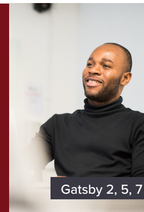
Gatsby 2, 5, 7

This presentation provides an overview of the application process covering all of the parts on the UCAS application form. The presentation covers do's and don'ts for the different sections, how to write an effective personal statement, how to make the right course/ university decision, tips on attending university interviews and the different entry pathways to university.