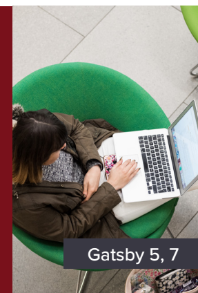
Gatsby 5, 7

The student life presentation is delivered by our Student Ambassadors and gives an overview of what it's like to study at university. The presentation covers the transition from school/college to Higher Education, academic life, and the endless opportunities that are on offer to enrich the student experience.