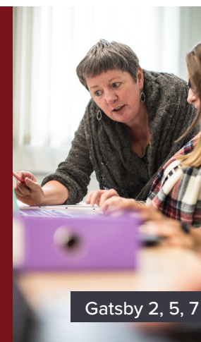
Gatsby 2, 5, 7

This presentation provides a detailed breakdown how applicants should complete their UCAS application form in order to give them the best chance of being accepted onto their course. The presentation covers an overview of the UCAS application process, guided walkthroughs of the application, do's and don'ts for the different sections, how to write an effective personal statement, and what happens once the application has been sent. This presentation can also be delivered as an interactive workshop.