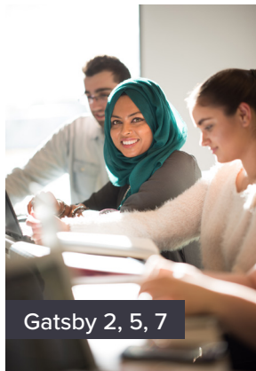
Gatsby 2, 5, 7