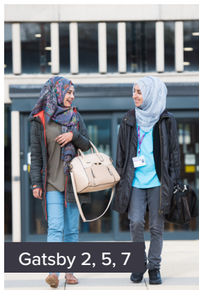
Gatsby 2, 5, 7