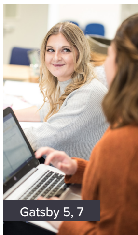
Gatsby 5, 7