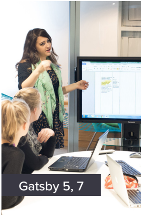
Gatsby 5, 7