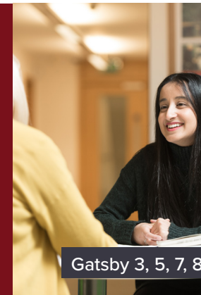
Gatsby 3, 5, 7, 8

This is a great chance for students to get a one-to-one check of their personal statement by one of our Student Recruitment and Outreach Team. We can then give feedback to help them check structure and content. We can also help them get started by using creative resources.