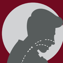
CHANGE OR LOSS OF SENSE OF SMELL AND/OR TASTE