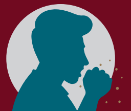
A NEW, CONTINUOUS COUGH

IF YOU HAVE ANY SYMPTOMS, REPORT TO THE UNIVERSITY AND HAVE A TEST.