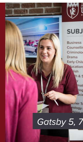
Gatsby 5, 7

This presentation is predominantly aimed at Year 12 students as they begin to explore Exhibitions and make plans to attend Open Days (face to face and virtually). The presentation gives them top tips as to how to make the most of events, how to prepare, what to expect when they are there, questions they may wish to ask, and what they need to do following the event to make the most of their experience.