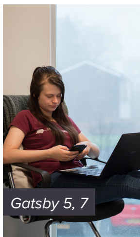
Gatsby 5, 7