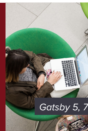
Gatsby 5, 7

The student life presentation is delivered by our Student Ambassadors and gives an overview of what it's like to study at university. The presentation covers the transition from school/college to Higher Education, academic life, and the endless opportunities that are on offer to enrich the student experience.