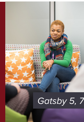
Gatsby 5, 7

In addition to mock interviews, we also offer a general presentation on preparing for university interviews which aims to give students an insight into the various types of university interviews, whilst also giving them the essential interview tips.