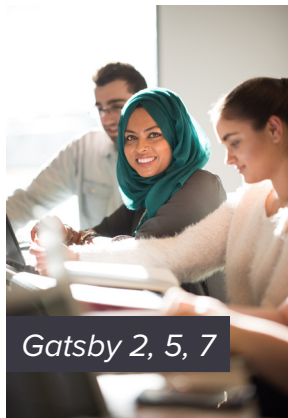
Gatsby 2, 5, 7