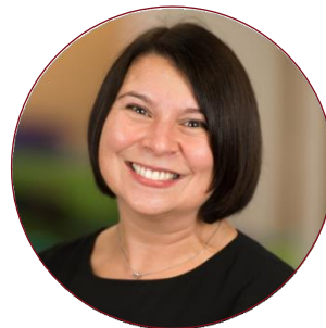
Chair of Council